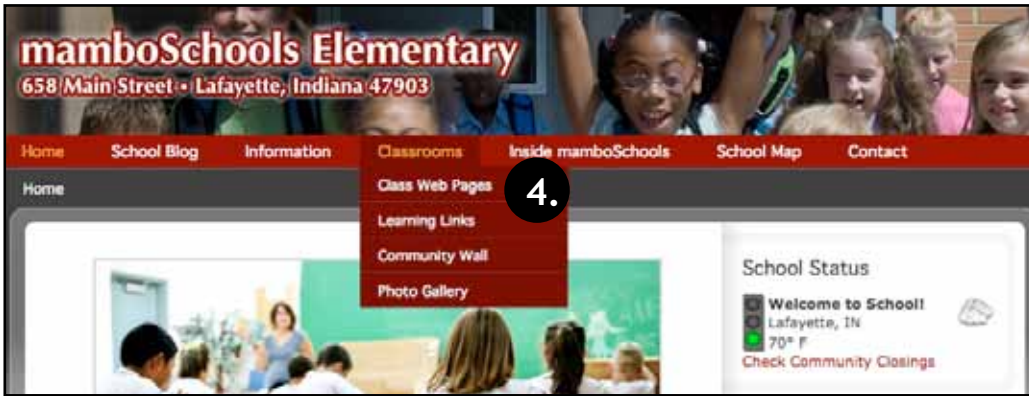
Figure 2 - Home Page Menu